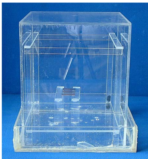
Figure 2 Thioacetamide Test Chamber