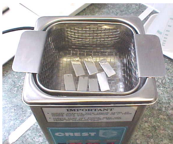
Figure 1 Ultrasonic Solvent Cleaning Bath